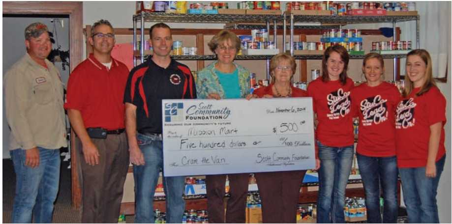
Mission Mart in Conway Springs received a $500 donation and 450 pounds of food from the "Cram the Van" food drive.

We recently completed our "Cram the Van" food drive, collecting 6,615 pounds of food for hungry people in Western Kansas. That's nearly three and a half tons of food, enough by some calculations to keep a single food bank stocked for nearly six months. The effort also brought in $850 in cash donations. Every donation collected in a particular community stayed in that community to benefit its local food bank.