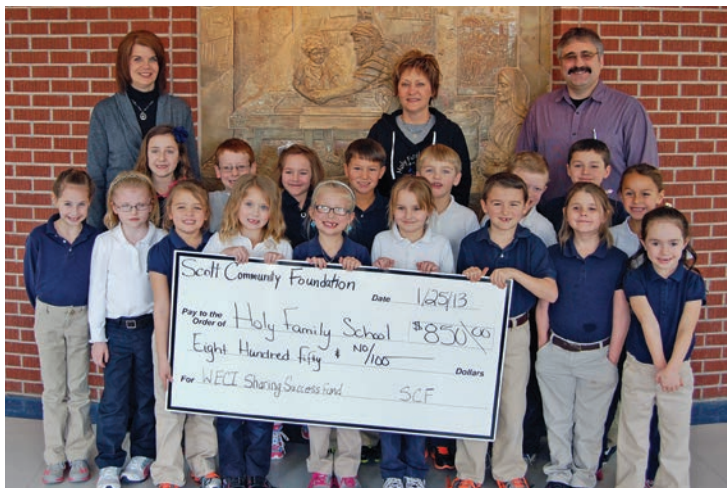
Wheatland’s Sharing Success program gives $10,000 to local charities each year. Holy Family Schools was one of many recipients in 2013.

Each month in 2015, we will highlight good news about Wheatland, our members, and our community. Some of those positive programs include: