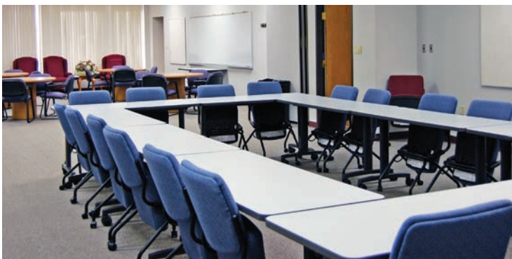
Our state-of-the-art Bryan Conference Center is available for community groups for free. Email us at info@weci.net for more information.